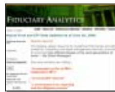
Free Trial to Fiduciary Analytics