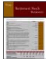
Retirement Analysis Worksheet