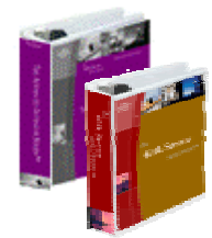
Binders to Give Clients for Course Summaries