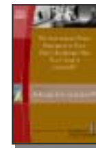
Marketing pieces for each separate topic