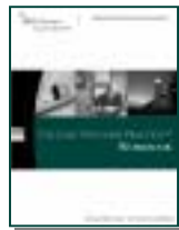
Workbook with forms like the Fiduciary Compliance Checklist to gather data, identify shortfalls, and document decisions