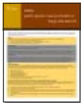
15 Plan Sponsor Education Topic Sheets