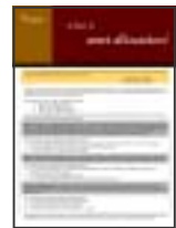
25 Participant Education Topic Sheets