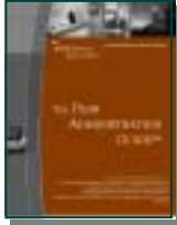
Educate Sponsors on changes that affect a plan