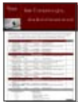
Risk Tolerance Questionnaire