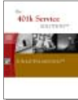
Complete Six-Course Version to cover all Issues as a set (All of the topics have a PowerPoint version of the educational Course Book for presenting to sponsors)