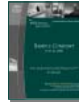
Summary Templates with Complete Review of Investments and Ongoing Monitoring Checklists