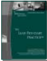
Educate Sponsors on meeting fiduciary standards