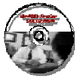
Template Disk of tools in editable form