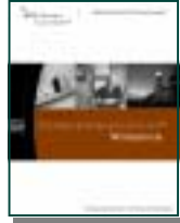
Workbook with forms like the Document Review Checklist and Sponsor Education Needs Worksheet