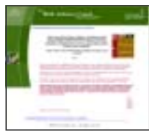
PPC Only Website and listing on Sponsor website