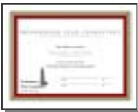
PPC Designation Certificate