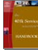
Resource Handbook To Give Plan Sponsors