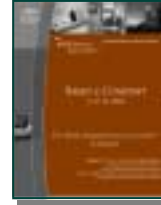
Summary Templates with One-Year Plan Management Calendar and Plan Review Checklist