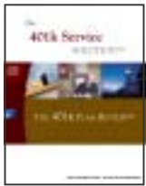
Small Plan Version